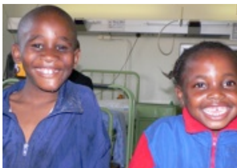
(Some of the first children we visited in 2005)

After 6 years and over 6,000 visits to hospital it may seem strange to hear that we are only just getting started. And yet that is exactly what we have felt recently. The work in the hospitals is now well established as over the years we have earned the respect of the staff and the right to minister to the children.